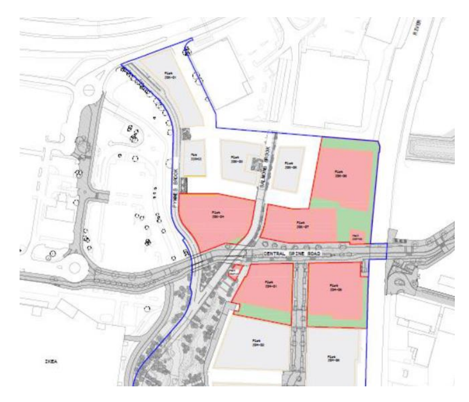
Figure 1: Plan of Meridian Four Development Plots

38. On the 16<sup>th</sup> September 2020, Cabinet approved (KD5174) the Phase 2 Detailed Delivery Plan and the recommendation within it for the direct delivery of Meridian Four. Meridian Four comprises of five blocks sited to the north of the Phase 2 scheme to be delivered with commercial and community uses at ground floor and upper floors to provide Build to Rent and affordable homes.